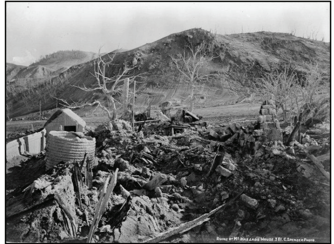
Remains of the schoolhouse after the eruption