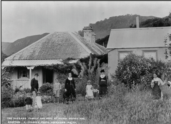
Haszard home and schoolhouse at Te Wairoa before the 1886 eruption of Tarawera.