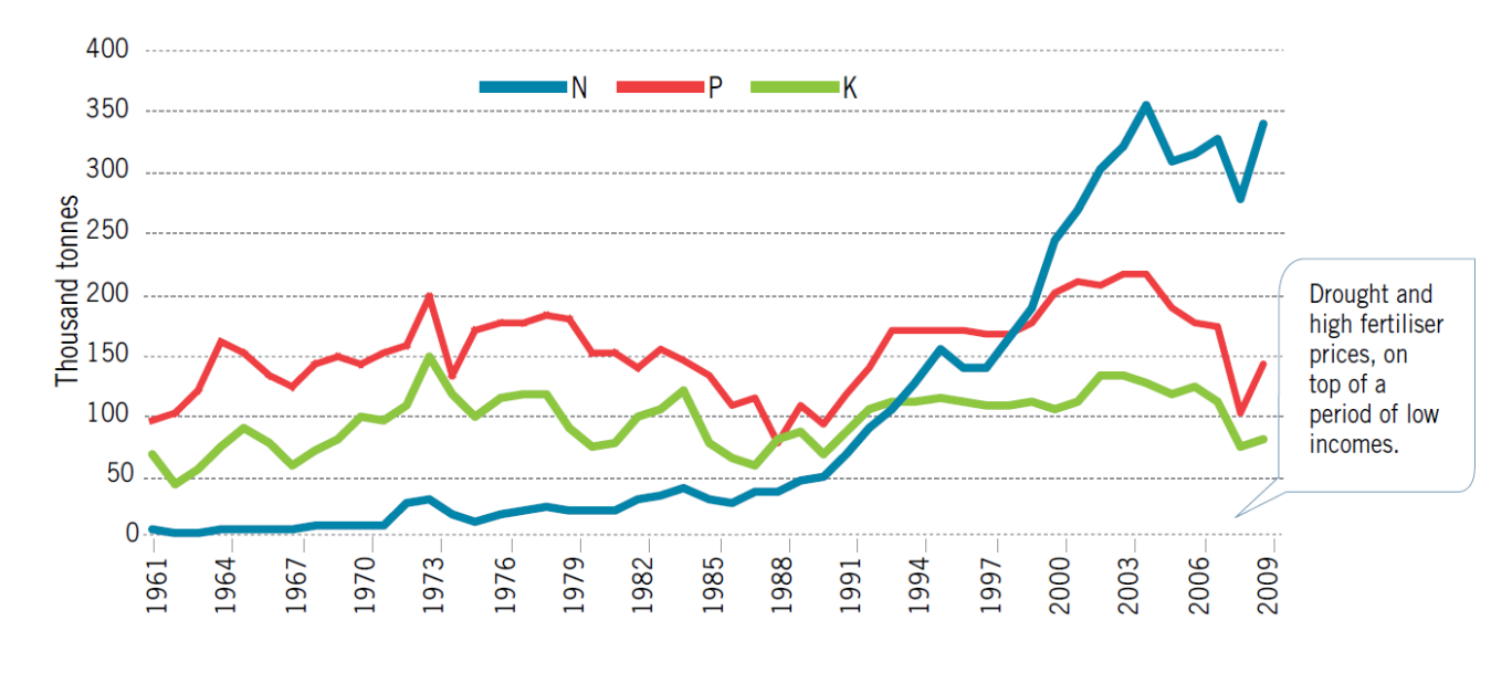
Figure 2: Use of nitrogen (N), phosphorus (P) and potassium (K) fertiliser in New Zealand.<sup>11</sup>

onto the farm that leaves as animal protein rather than as losses to water or the atmosphere. Much of the research currently under way aims at providing farmers with a set of options to allow them to optimise farm practices with the goal of increasing profit per unit of nitrogen lost to the environment. Where farmers face nitrogen caps (for instance, around Lake Taupo) this is already in progress using annual estimates of nitrogen loss. However, measuring actual on-farm nitrogen losses to inform daily farm management remains difficult.